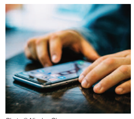
You find more professional apps for iOS than for Android

So the studio in your pocket is not a concept for the immediate future. For the time being it's more like making do with a Swiss army knife.