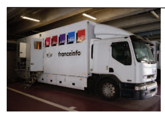
Radio France's outside broadcast vehicle, ready to go