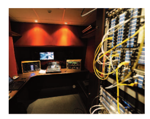
Mobile control allows the recording of concerts, but also the retransmission of live

This mobile broadcast vehicle, which is used in quite specific circumstances, offers many advantages, but there are also disadvantages or restrictions. According to David Aneas, "The biggest advantage is speed in setting up. Everything is already wired and installed inside the vehicle and a simple fibre optic cable serves to link it up to the stage. On the other hand, the bulkiness of the vehicle can cause problems: it doesn't allow for it to be parked just anywhere in town. The power supply also limits the locations that can accommodate it. Mobility does not mean energy self-sufficiency. It has to be plugged into a power outlet." The OB vehicle represents a substantial investment, which we try to absorb through its shared use by the different Radio France stations. •