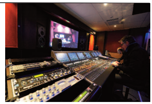
The on-board control room has the same capacity as the broadcasting house studios